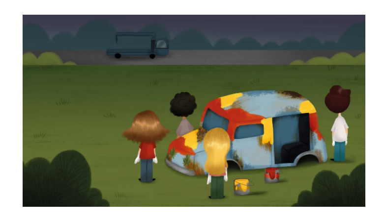
They heard a tow truck pull up.