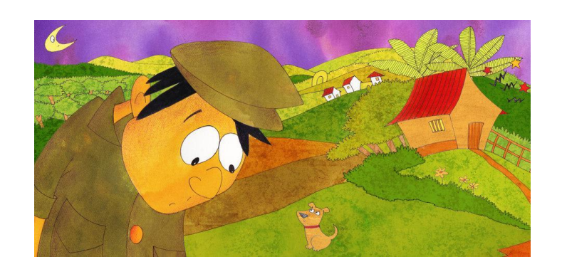
Moti, the dog took pity on him. He barked and looked towards the store nearby. Ah! Toto finally had a lead.