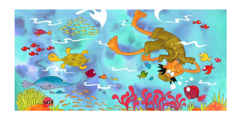
Gogo was not to be found. Toto took a deep breath and dived into the river. What if Gogo was holding his breath and hiding underwater?